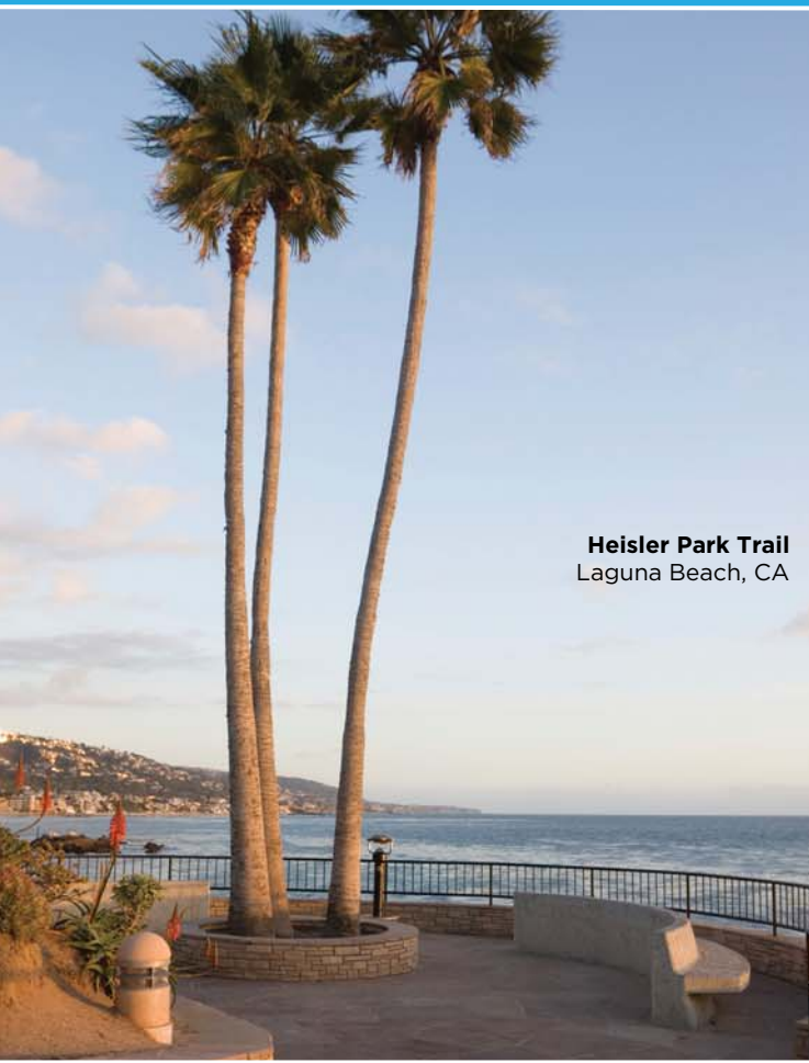
Heisler Park Trail Laguna Beach, CA

VISITOR SERVICES WATER SPORTS ATTRACTIONS SIGHTSEEING LODGING DINING HELPFUL NUMBERS