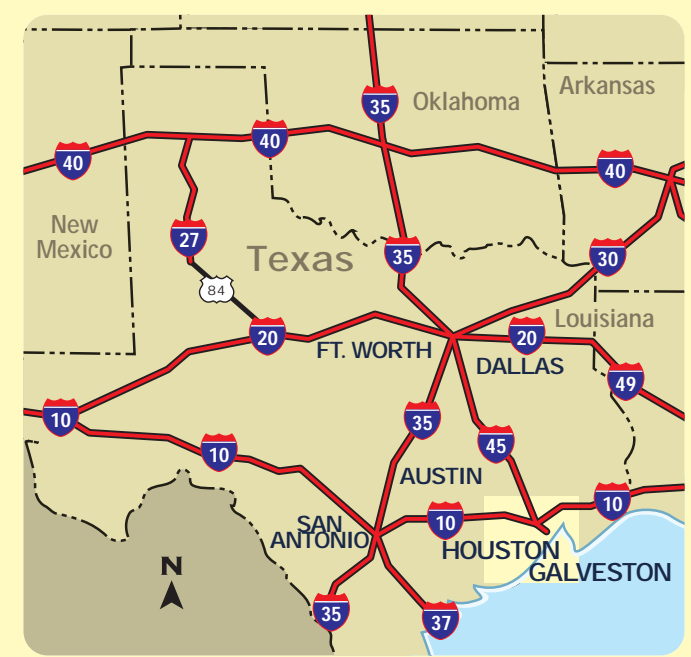
DISTANCE IN MILES BETWEEN HOUSTON AND . . .